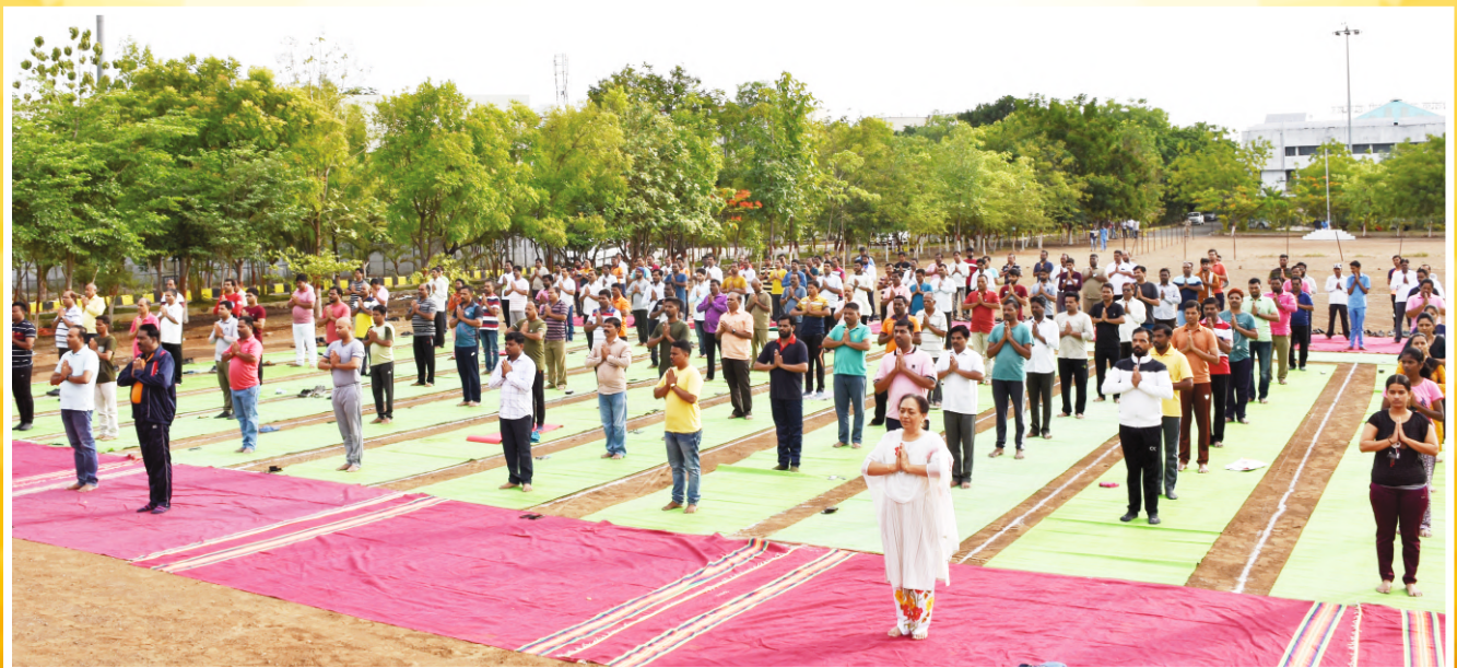
Celebration of International Yoga Day