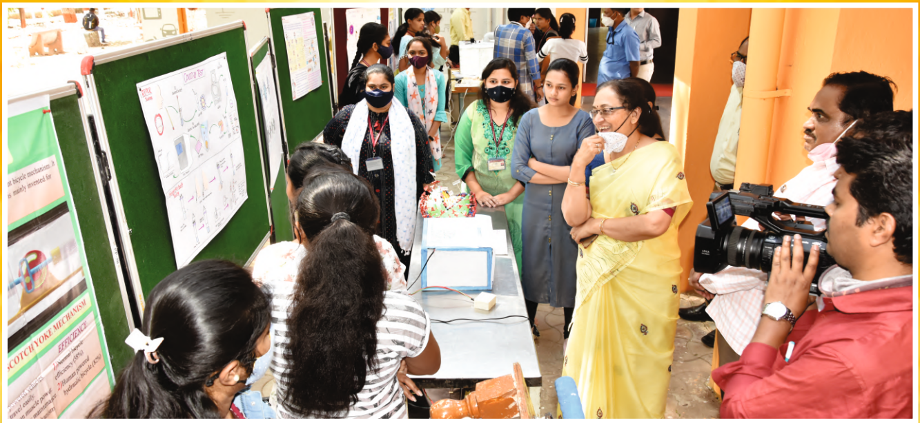
Celebration of Science Day