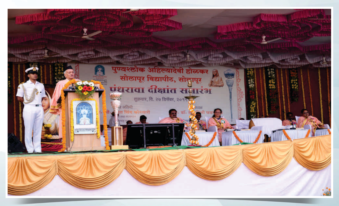
Convocation address by His Excellency the Governor and Chancellor Bhagat Singh Koshyari Guest on the Occasion of the 15<sup>th</sup> Convocation Ceremony