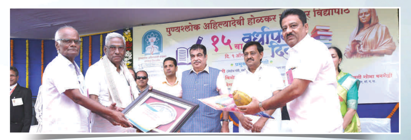
Outstanding Educational Institution Award Shri Shivaji Shikshan Prasarak Mandal Barshi