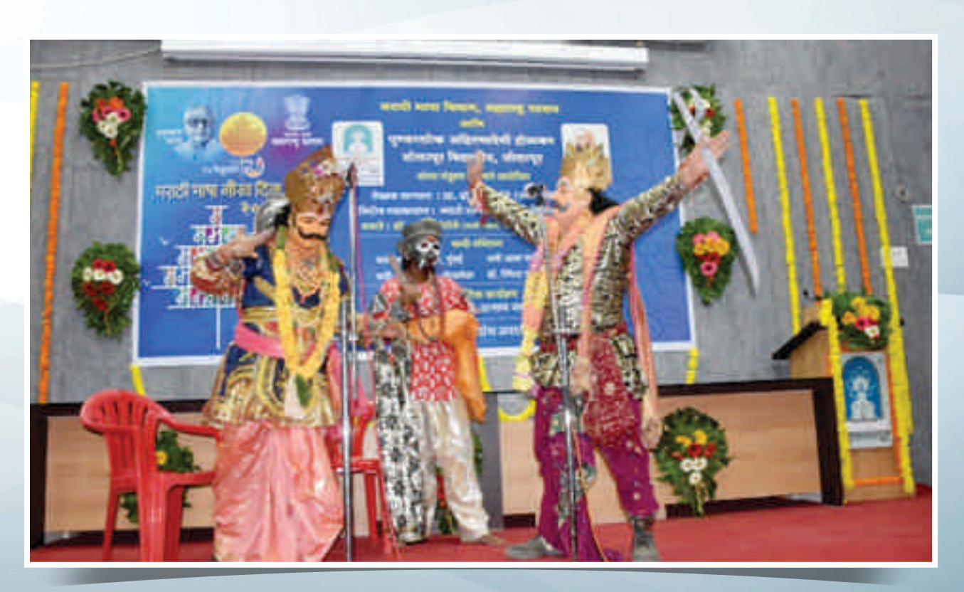
Folk Art Presentation