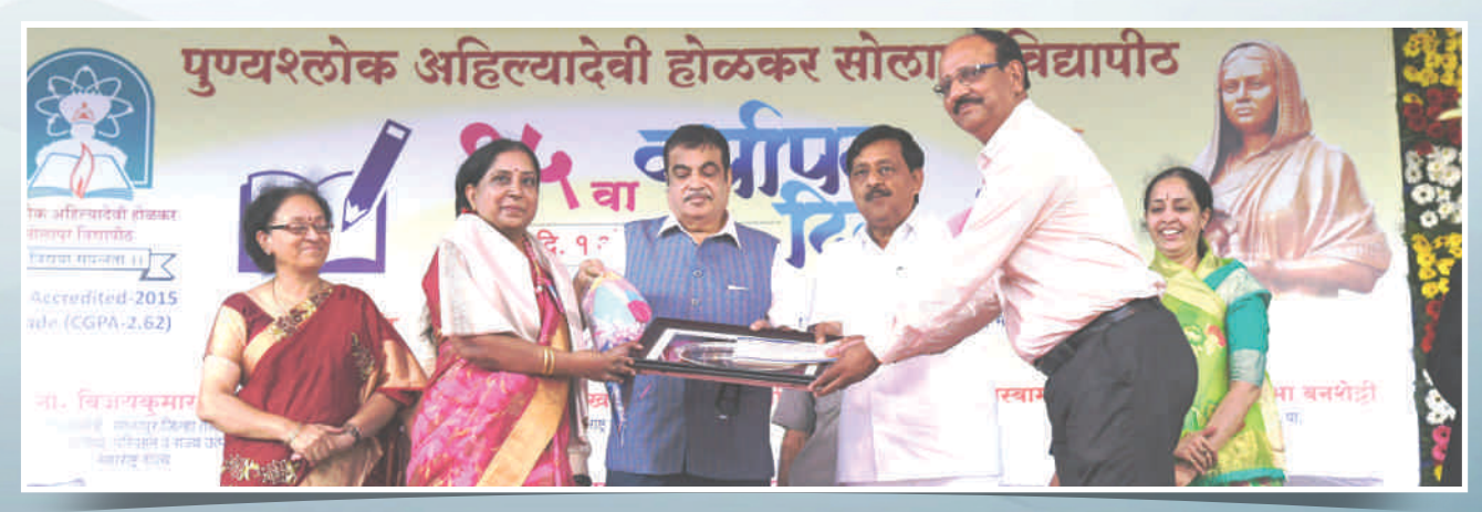
Outstanding College Award Sangameshwar College Solapur