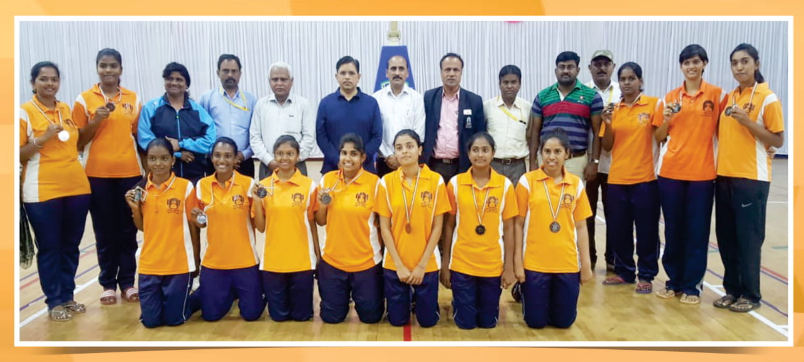
Maharashtra State Interuniversity sports competition – 2018: Silver medal winning Basketball (Girls) Team