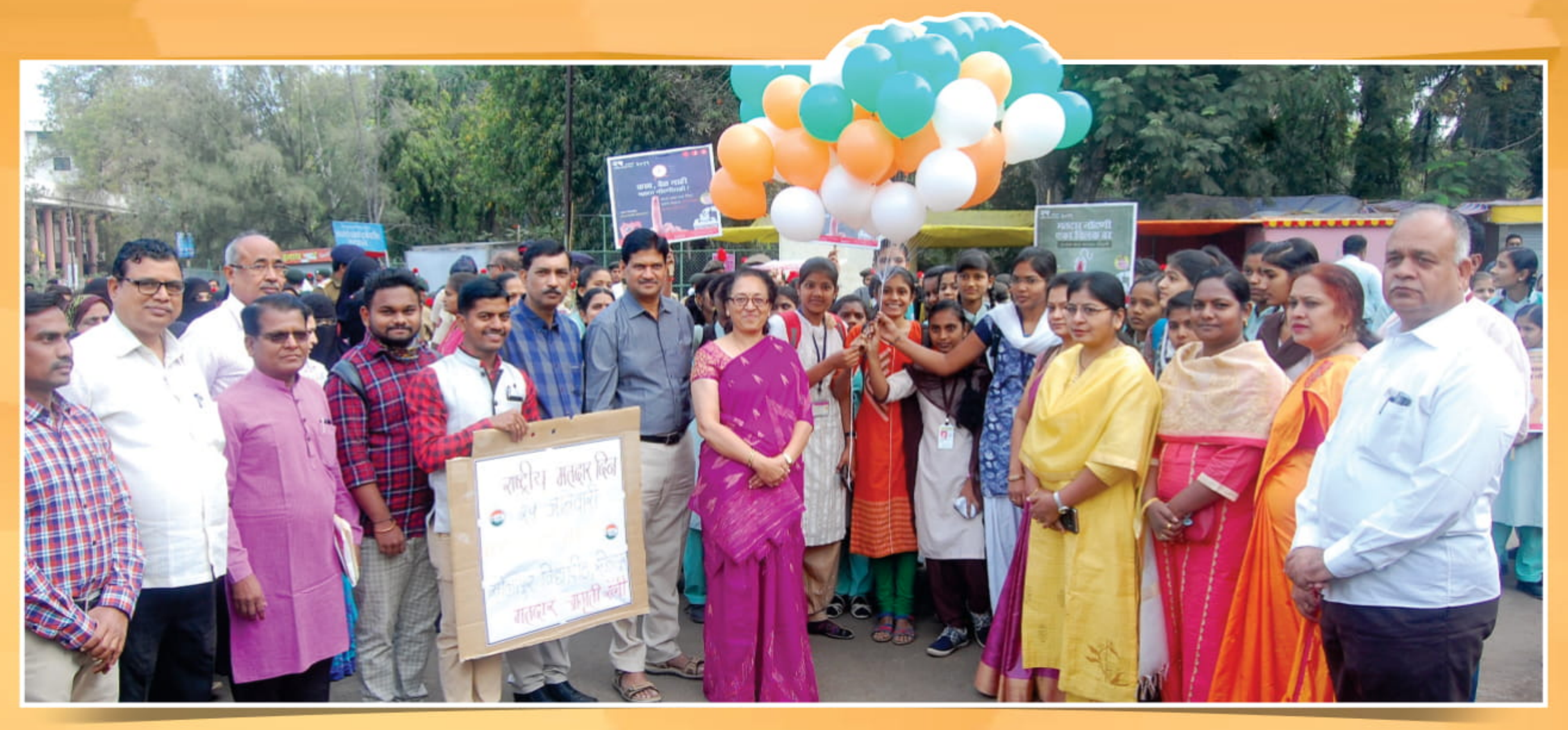
National Voter Day - Voter Awareness Rally