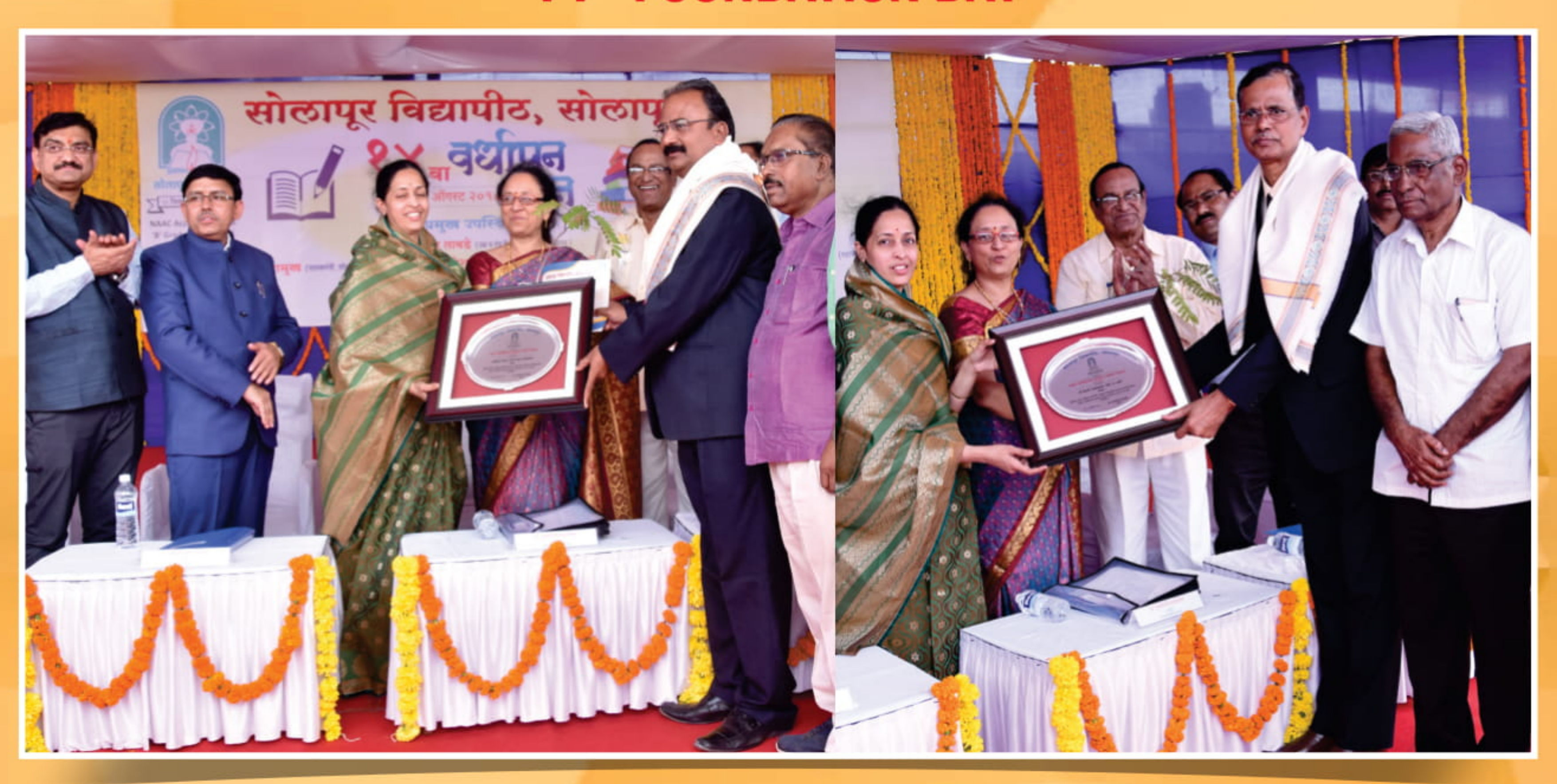
14<sup>th</sup> Foundation Day: Best College (City): Laxmibai Bhaurao Patil Mahila Mahavidyala, Solapur